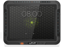
External Touch Screen