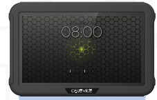
External Touch Screen